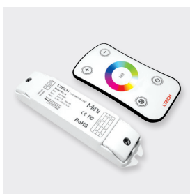
RGB RF CONTROLLER