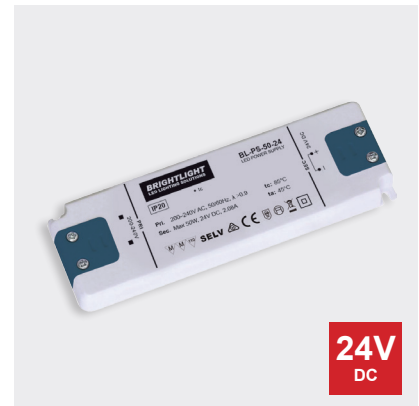
50 WATT POWER SUPPLY